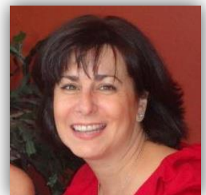
Lisa Miklos Awards & Appreciation

I now have the privilege of introducing to you (and in some cases re-introducing to you) the Sheila Baker Award for Outstanding Achievement.